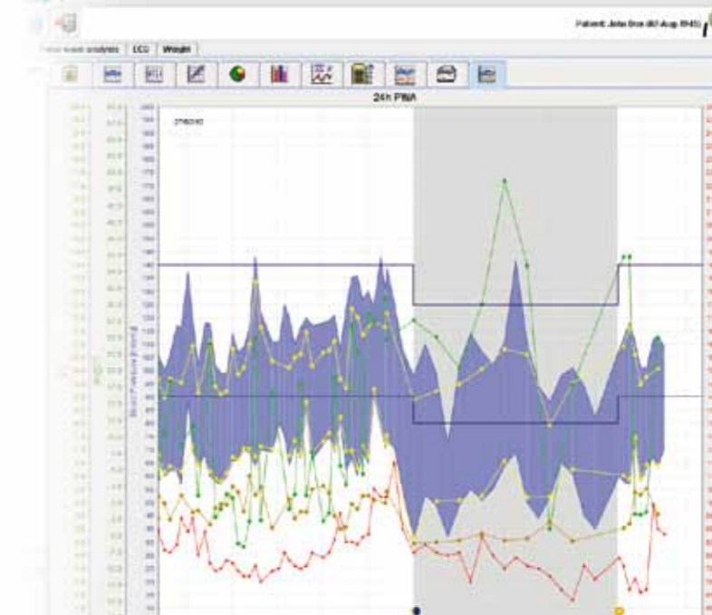
24h PWA profile